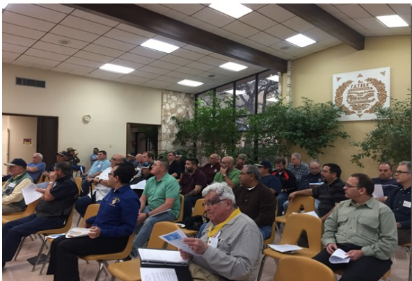
BROTHER KNIGHTS LISTEN TO A BRIEFING ON LENT GREEN GIANT CHALLENGE