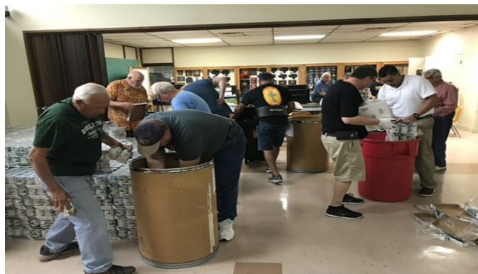
Brother Knights busy putting 6000 donated cans in barrels for the 40 cans of the lent drive.