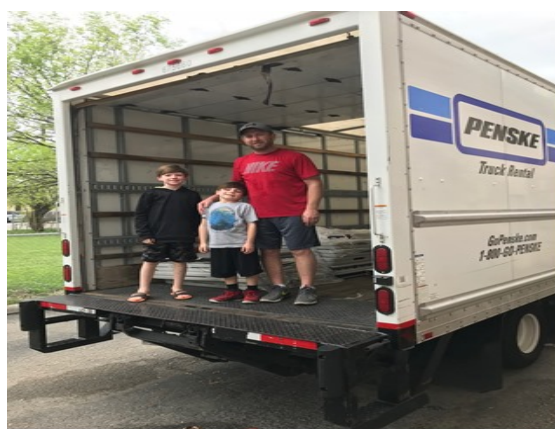
BRO. PATRICK & SONS DELIVER GREEN GIANT MATCH OF 6,000 CAN FOOD DELIVERED TO THE PARISH