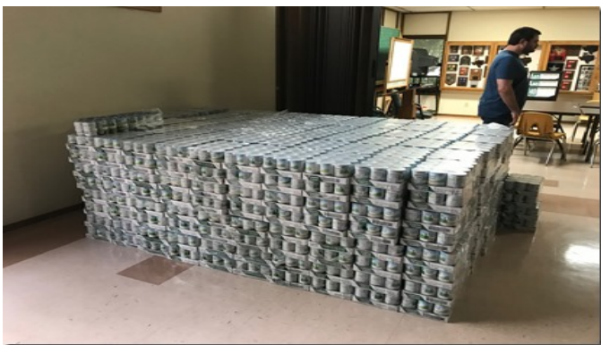
6,000 GREEN GIANTS CANS DONATED BY PARISH MEMBERS, GREEN GIANT MATCHED THIS TOTAL GIVING US A TOTAL 12,000 CANS FOR THE 40 CANTS OF THE LENT DRIVE.